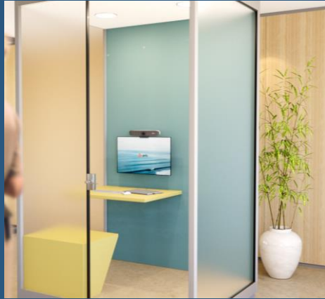
VC POD Solutions

Empower your GUESTS with seamless communication and collaboration with Small, multi-purpose meeting rooms