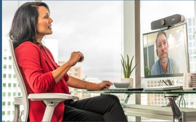
Business Centre VC Station