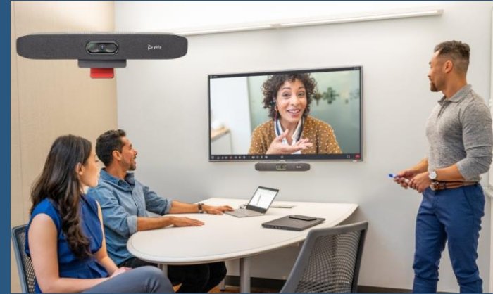
VC Meeting Room